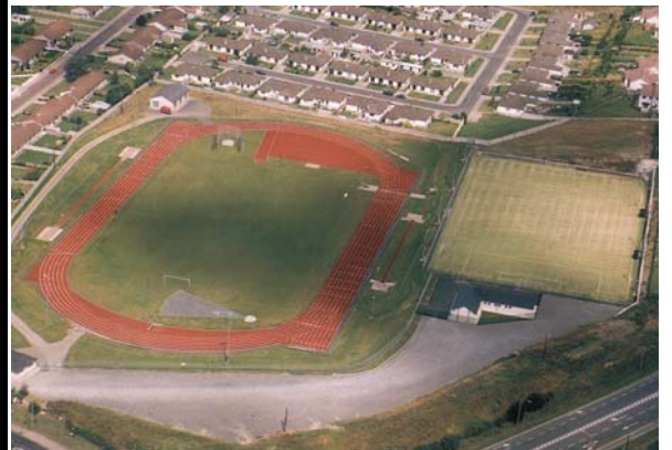
Scanlon Park receives funding

The next South Eastern RAPID Community meeting is scheduled for September in Waterford for further details contact the Kilkenny Community reps, Mags Leahy, Billy MCCullagh & Nora Webster.